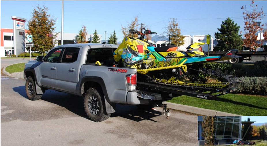
New Mountain Edition shown in a Toyota Tacoma

When not in use it can be used as a display tray in your showroom or as a storage tray to easily move your sled around your shop or garage when not in use.