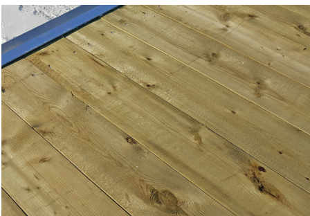
2" TREATED SPRUCE FLOOR