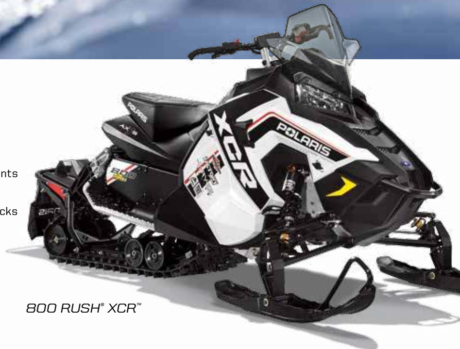
800 RUSH ® XCR ™