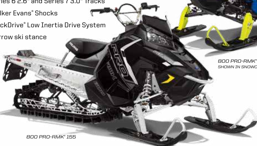
800 PRO-RMK® 155

FIND OUT MORE ABOUT THE RMK® TERRAINDOMINATION.COM