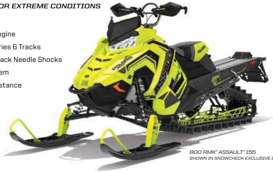
800 RMK ® ASSAULT ® 155 SHOWN IN SNOWCHECK EXCLUSIVE COLOR