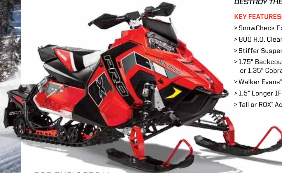
800 RUSH® PRO-X SNOWCHECK EXCLUSIVE MODEL & COLOR