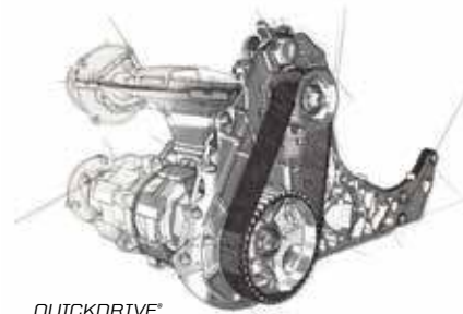
QUICKDRIVE® LOW INERTIA DRIVE SYSTEM