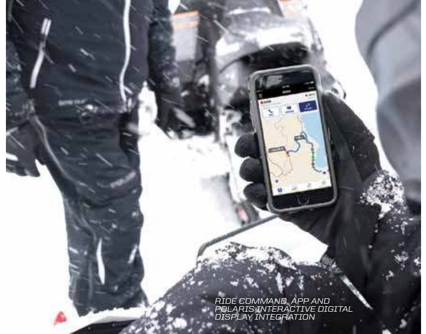
RIDE COMMAND APP AND POLARIS INTERACTIVE DIGITAL DISPLAY INTEGRATION