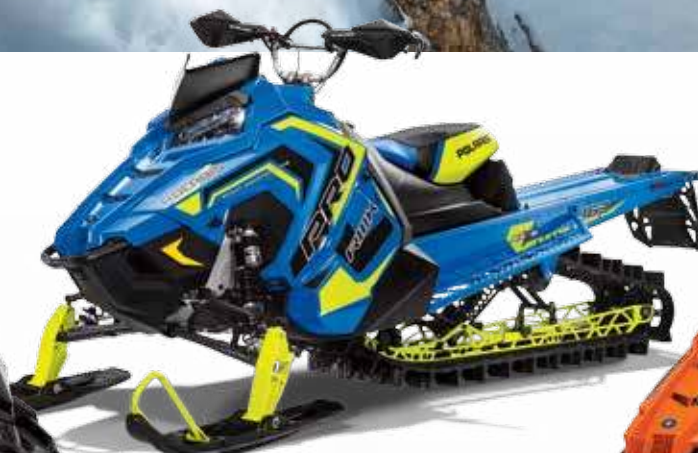
800 PRO-RMK® 163 SHOWN IN SNOWCHECK EXCLUSIVE COLOR