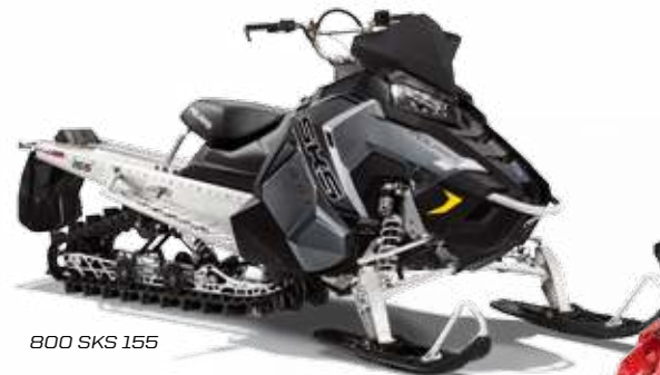
800 SKS 155