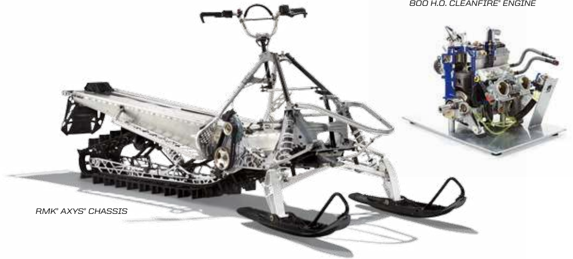
RMK® AXYS® CHASSIS