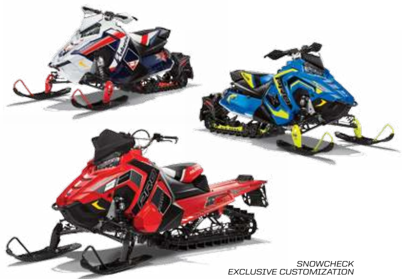
SNOWCHECK EXCLUSIVE CUSTOMIZATION

Quite simply, it's about delivering you the best sled. Sleds purpose-built for where you ride and how you ride. Built with innovative technology and exclusive customization to give you the perfect sled, designed specifically for you.