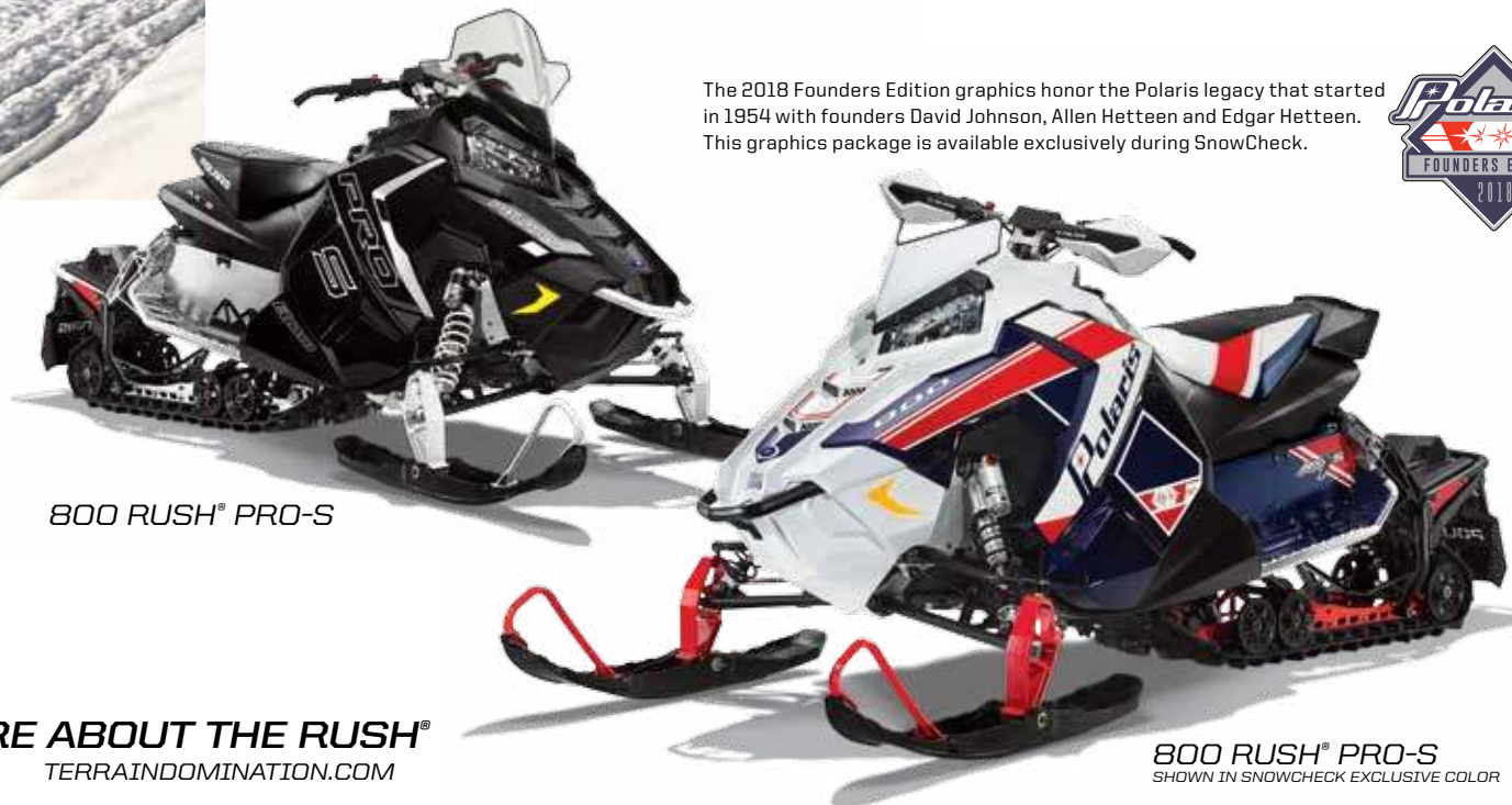
800 RUSH® PRO-S