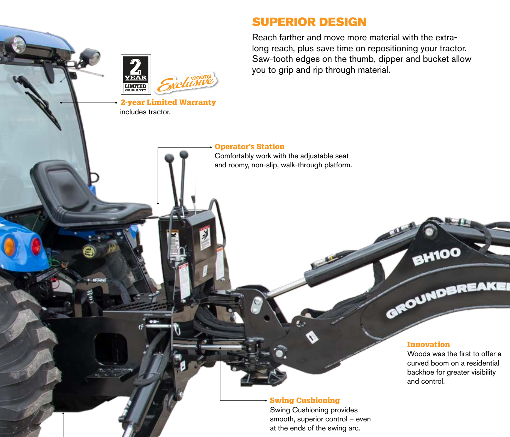
3-point Saf-T-Lok® hitch No tools needed to attach or detach. (sub-frame shown)