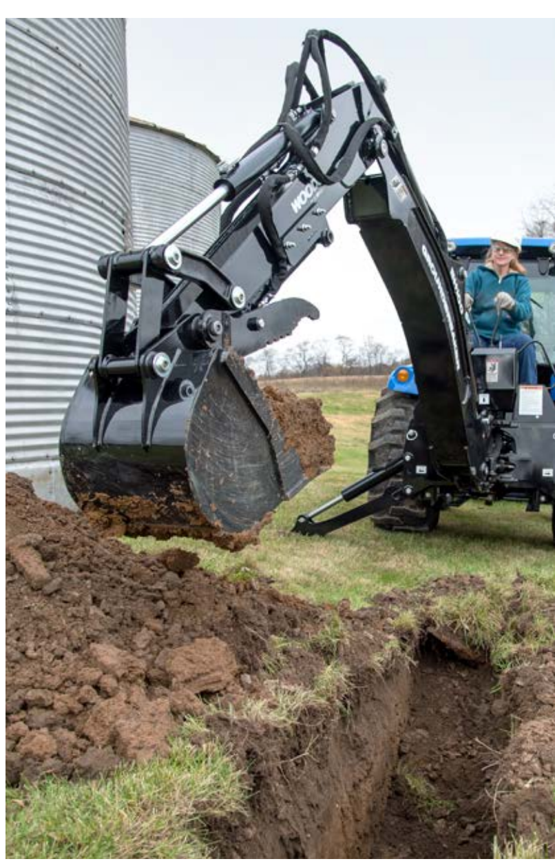
BH100 shown with optional thumb