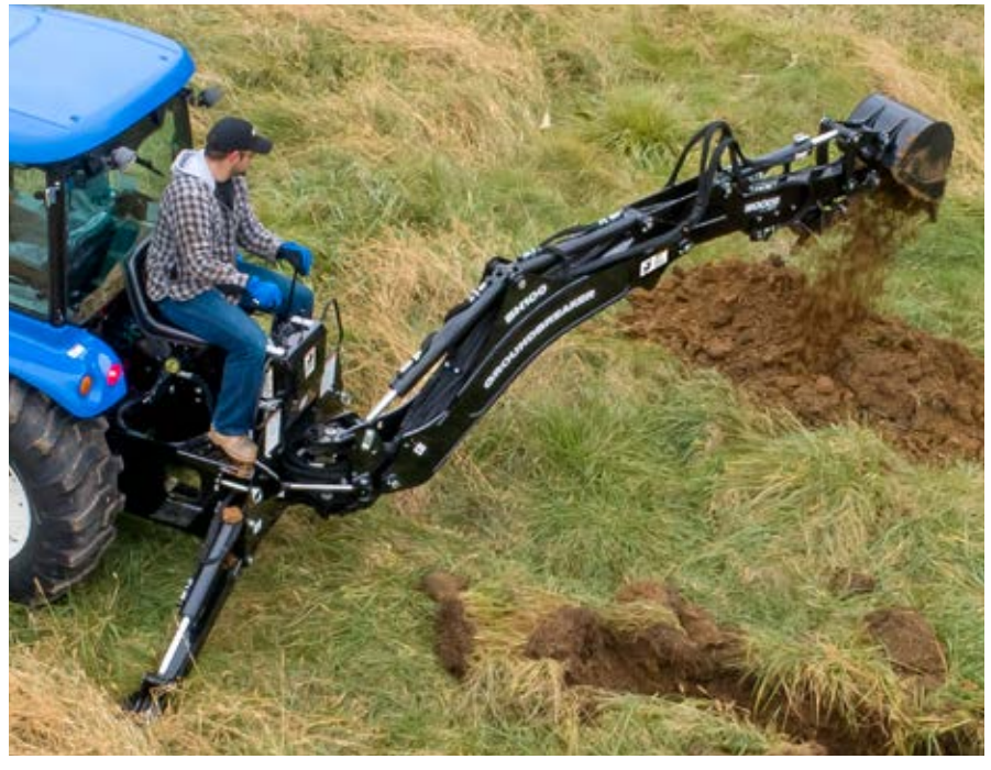
BH100 shown with optional thumb