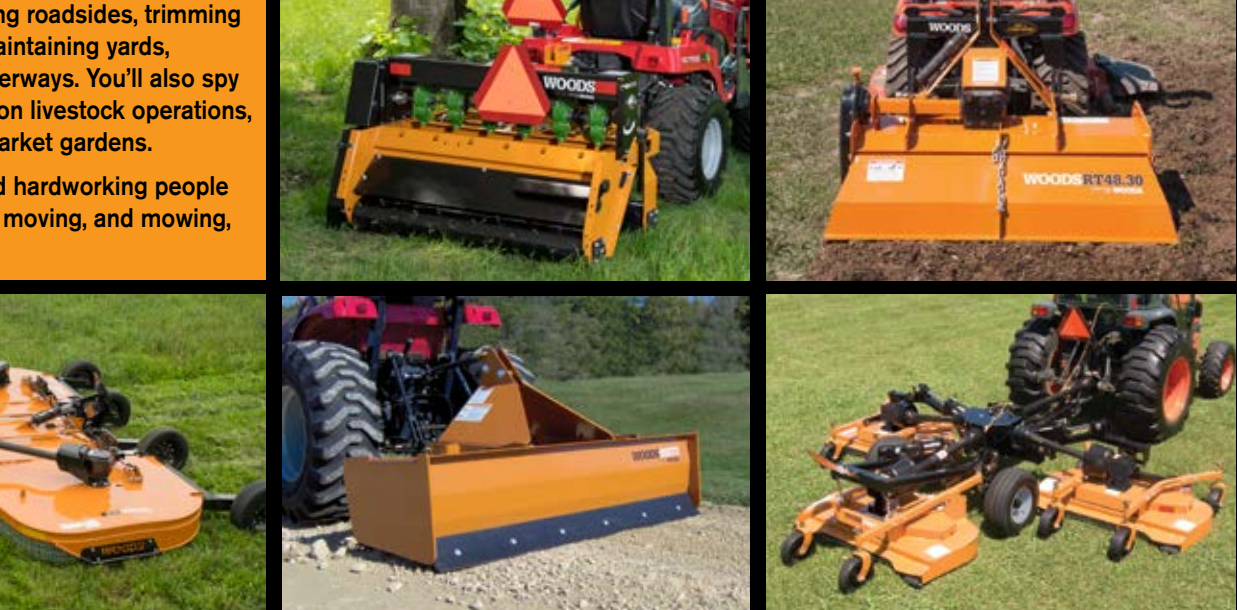
For additional information on our full line of Woods Equipment, visit woodsequipment.com or see your local authorized Woods dealer.

Wherever you find hardworking people digging, growing, moving, and mowing, you'll find Woods.