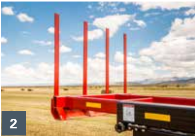
[1] Two hydraulic motors power the bale pusher [2] Rear unloading forks [3] Reinforced carrier arm [4] Pusher chain [5] Hydraulics

The Farm King 4480XD Square Bale Carrier improves its capacity with 9 4'x4', 18 3'x4' and 24 3'x3' bales picked per load. With full customization and the quarter turn option you can configure it to perform to your operation's needs. The 4480XD features a host of new innovations and technology designed to increase efficiency, maximize durability and minimize bale damage.