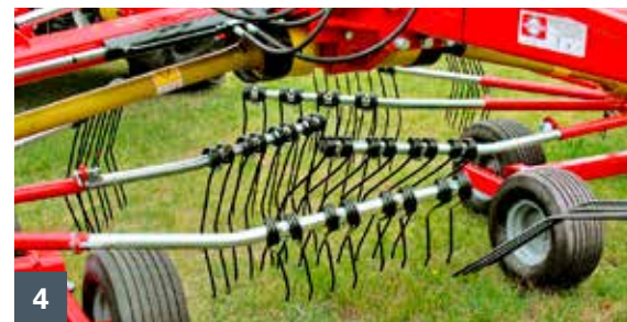
[1] Cardan shaft. [2] Complete cleaning of the ground thanks to the intersecting arms. [3] Steering system allows great maneuverability. [4] Full intersection of arms.