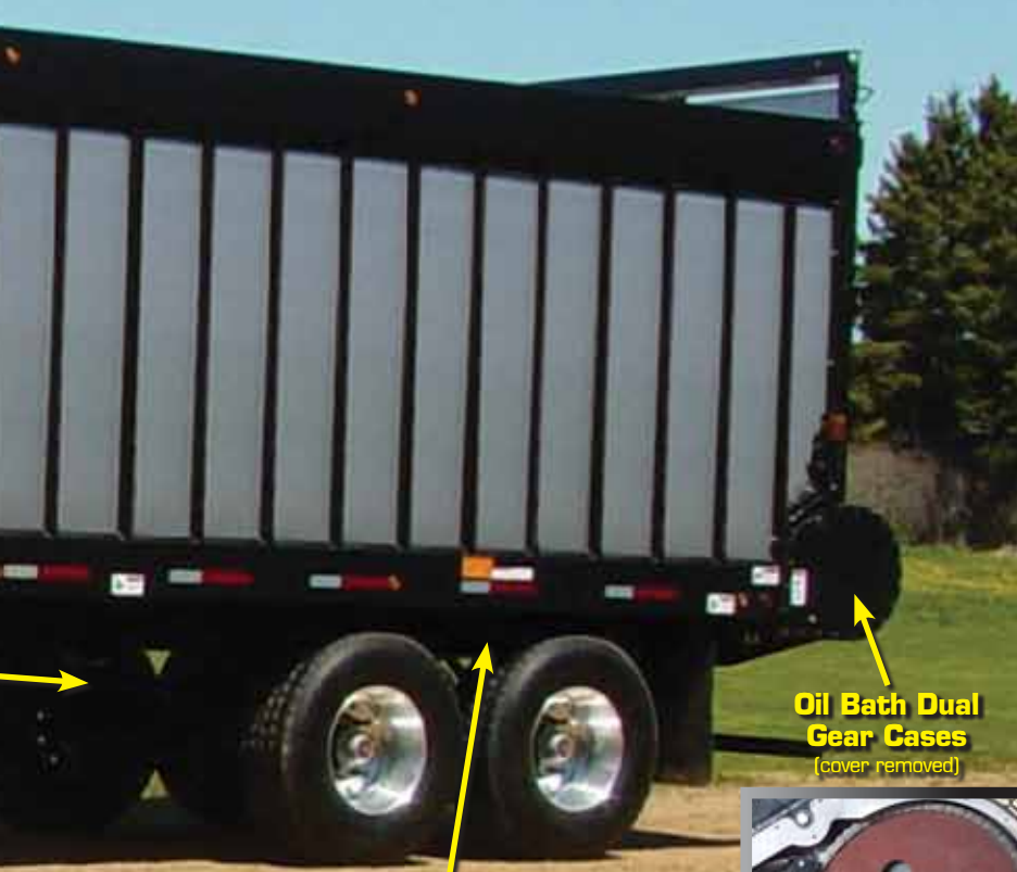
Oil Bath Dual Gear Cases (cover removed)

As above the front wheels act as a slide for the main apron chain, and protect mud and debris from getting on the apron chain.