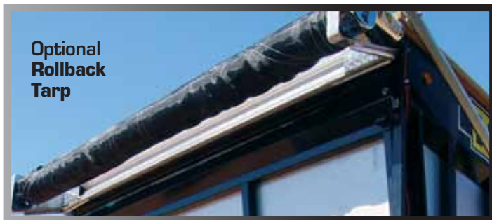
Optional Rollback Tarp

Warranty: See operators manual for warranty details and limitations. H&S reserves the right to change its products or the description at any time without notice or obligation.