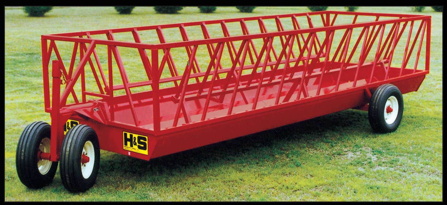
The inside sidewalls and end panels can be removed for better feeding of square or round bales. The panels are removable on the slant bar feeders.