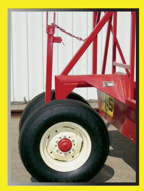
H&S bunks feature a 90° turning radius with tricycle front end, 6 hole hubs and wheels, and quick hitch tongue.

All models have a full axle all the way through the unit.