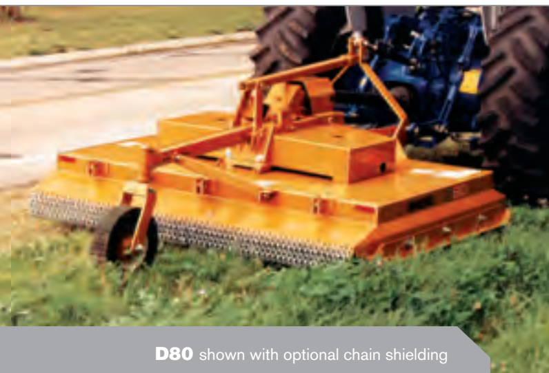
D80 shown with optional chain shielding