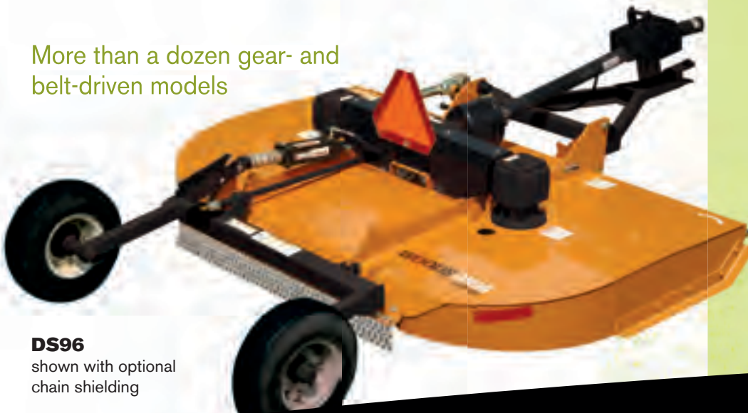
DS96 shown with optional chain shielding

More than a dozen gear- and belt-driven models