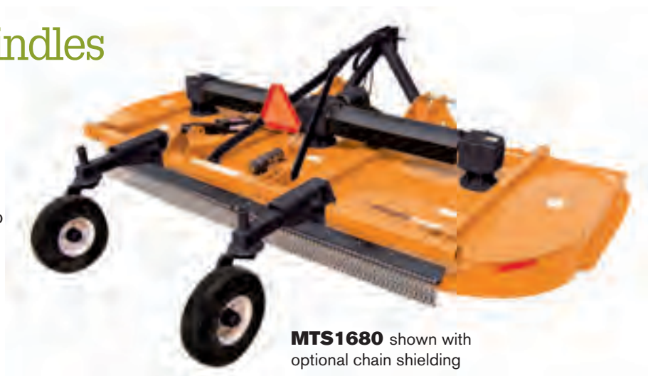
MTS1680 shown with optional chain shielding