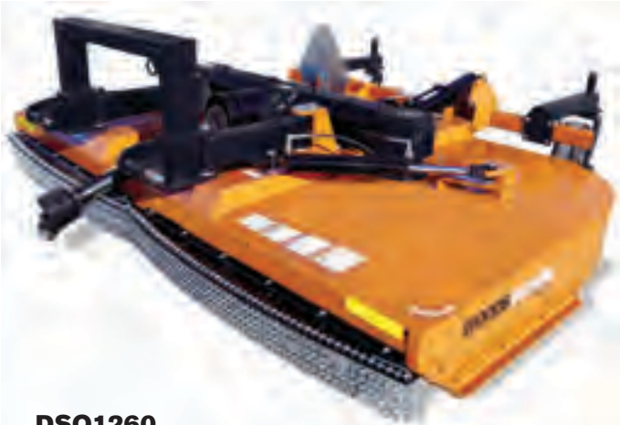
DSO1260 shown with optional chain shielding