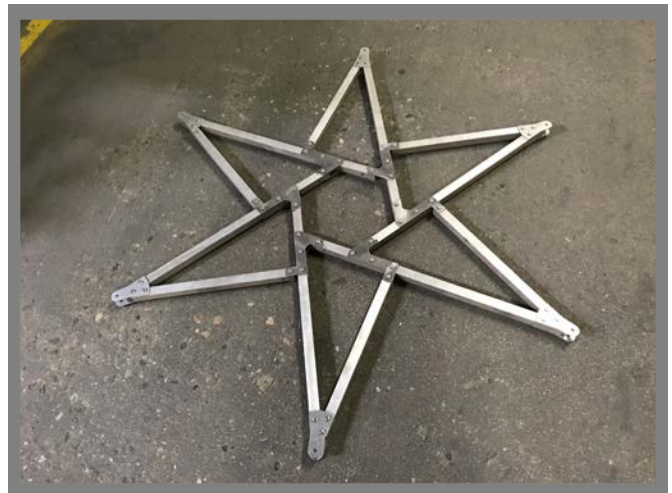
Aluminum Rectangular Tube Stars