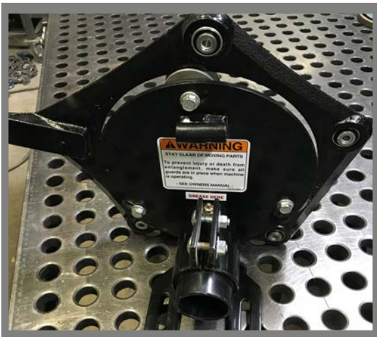
Heat Treated Cam Ring