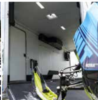
Multi-Season Enclosed Trailers