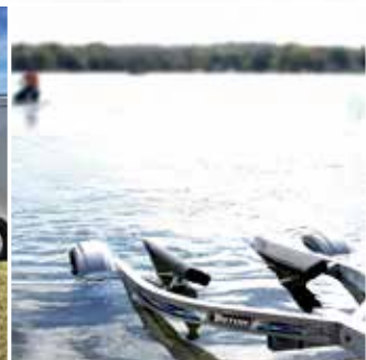
Personal Watercraft Trailers