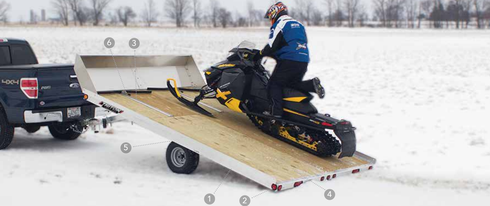
XT11-101 SQ Pictured With Accessories

Triton's open snowmobile trailers are designed for hauling one to four sleds. Choose from ramp or tilt bed models to suit your loading and unloading preference, and add accessories to customize and protect machines from salt and road debris.