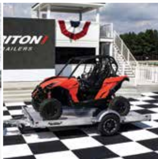
Off Road Vehicle Trailers