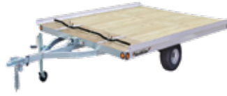
XT10-101 SQ Pictured With Accessories