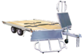
ELITE 16-101 Pictured With Accessories