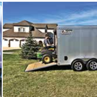
Cargo & Utility Trailers