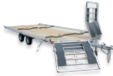
ELITE 22-101 Pictured With Accessories