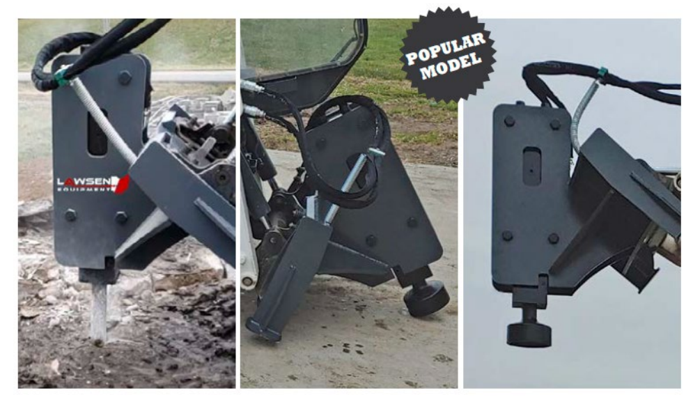
Economy Series Post Driver / Concrete Breaker

E - Series Post Drivers / Breakers - Are primarily designed for Farms, Ranchers, Rental Companies and More. Easily swap out the attachments to drive post or break concrete in less than 5 minutes!