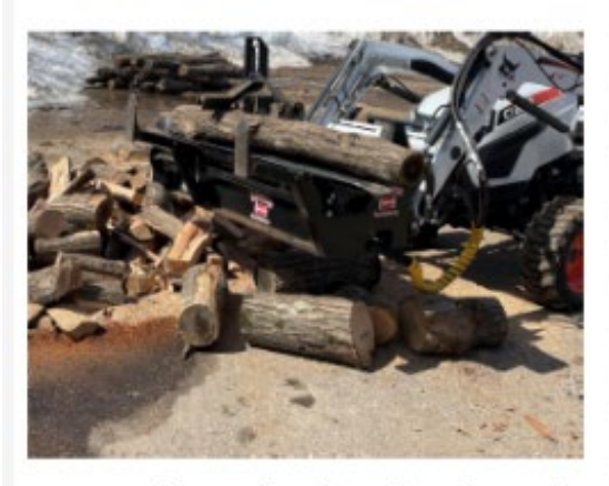
Operate the machine from the safety and comfort of the cab on your skid steer, mini excavator and/or tractor!