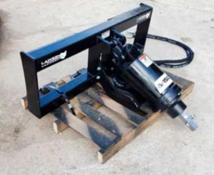
HEAVY DUTY AUGER DRIVES - 5 Year Warranty on Drive- 3 Year Warranty on Motor Complete Drive Unit - Includes 1/2" Hose Kit and Flat Face Couplers.