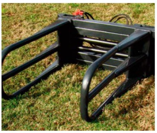
Square Lawsen Grabber