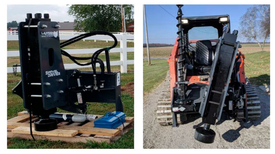
SWIVEL Skid Steer Mount Post Driver

PSW - Series Post Drivers - designed for hillside terrain. The Driver Swivels 30 degrees Right or Left.