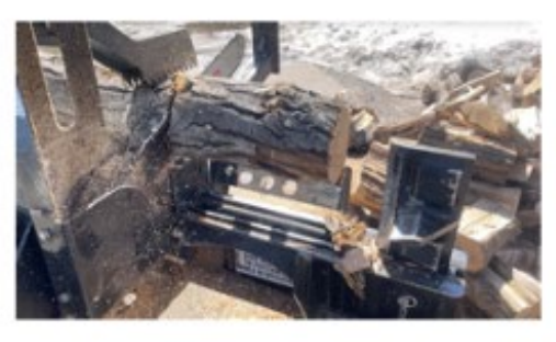
The HWP-100 is designed for the homeowner that cuts 1-10 cord per year.