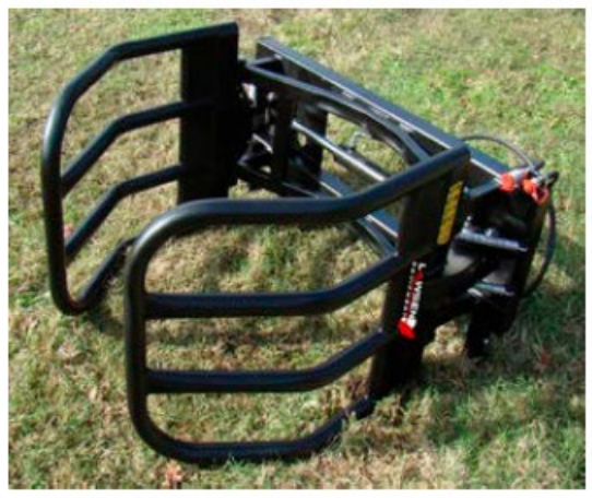
Round Lawsen Grabber