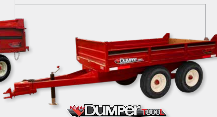
Mighty DUMPER T800L

The T800 Mighty Dumper is an 8-ton capacity, tandem axle utility trailer with removable 24" formed steel sides and a self-opening tailgate with a grain door. Dump box dimensions: 6' wide x 10' long with 24" high sides