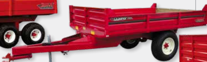
Mighty DUMPER S500L