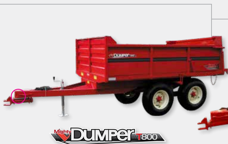
Mighty DUMPER T800