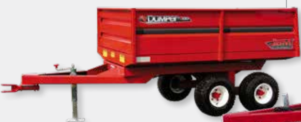
Mighty DUMPER T150