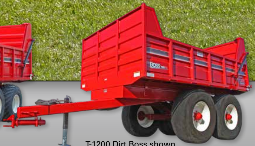
T-1200 Dirt Boss shown with 425 x 22.5" truck tires