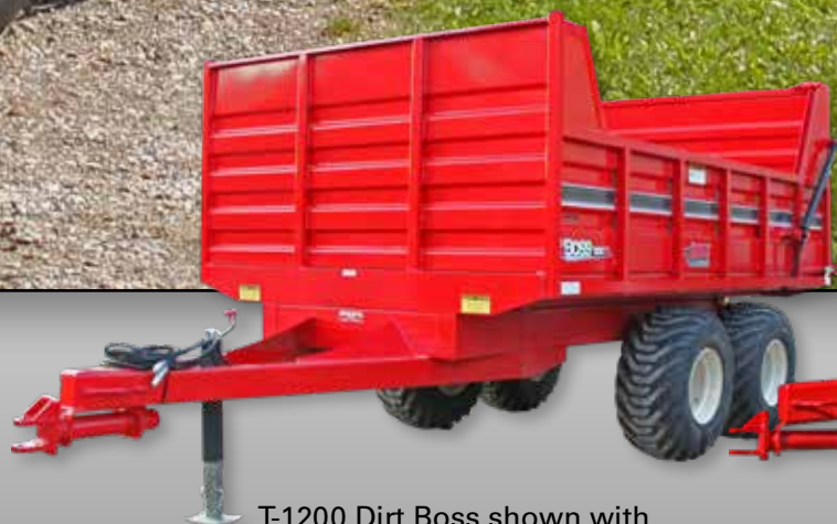
T-1200 Dirt Boss shown with 400/60 x 15.5" 14-ply flotation tires