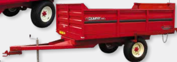
Mighty DUMPER S500

The T150 Mighty Dumper is a 1 1/2-ton capacity, tandem axle utility trailer, with removable 18" formed steel sides. Dump box dimensions: 4' wide x 6 1/2' long with 18" high sides