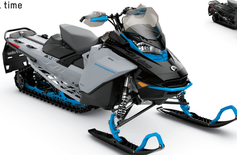
BACKCOUNTRY™ 146 850 E-TEC® SHOWN

Loaded with crossover-specific features for spending equal time riding on- or off-trail.