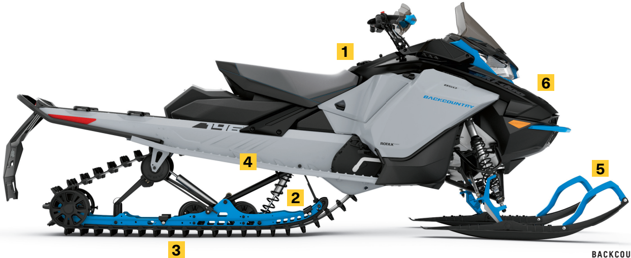
BACKCOUNTRY™ 146 850 E-TEC® SHOWN

Crossover-specific suspension uses best principles of the rMotion™ trail and tMotion™ mountain skids for confident cornering and agile boondocking.