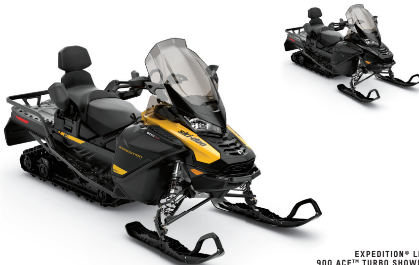
EXPEDITION® LE 900 ACE™ TURBO SHOWN

A hybrid touring sport-utility vehicle with premium features for off-trail exploration and on-trail cruises.