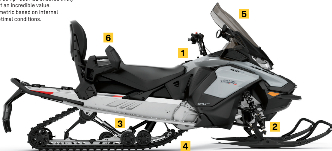
GRAND TOURING SPORT 900 ACE™ SHOWN

High-quality KYB high-pressure gas shock for excellent performance and reliability.