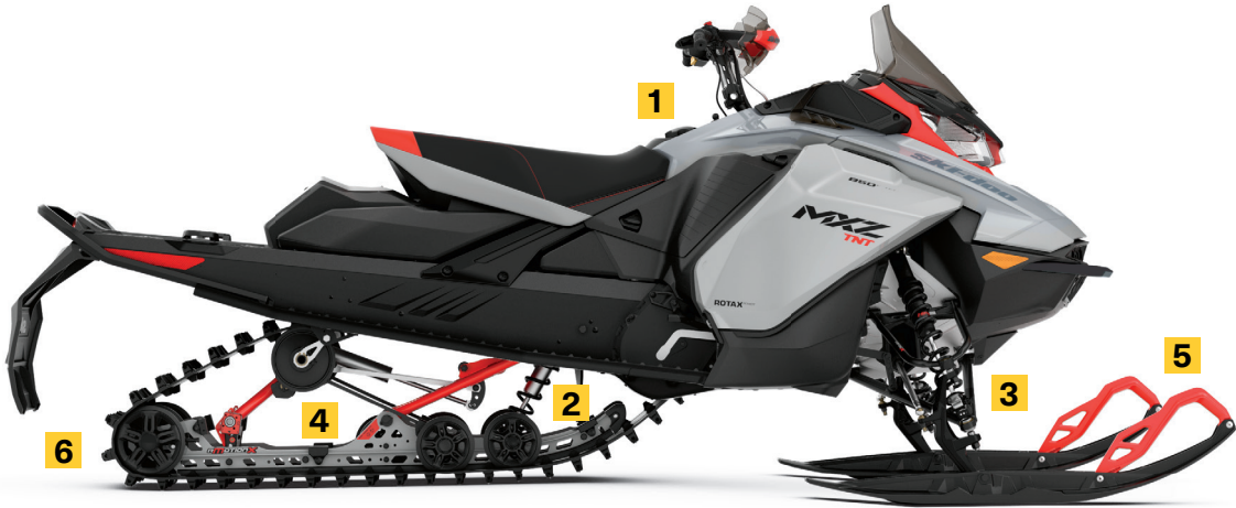
MXZ® TNT® 850 E-TEC® SHOWN

Flatter cornering and precision handling in all conditions. Developed in tandem with the rMotion X rear suspension to raise the bar in trail snowmobile chassis performance. Wider, adjustable ski stance and +1.0 mm of suspension stroke maximize stability, capability and comfort.