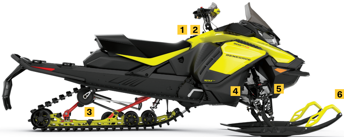
RENEGADE® ADRENALINE® 900 ACE™ TURBO R SHOWN

Built upon the same principles rMotion suspensions are renowned for, and then some. Completely redesigned for unmatched big-bump absorption and incredible comfort. Longer front arm with exclusive adjustable-angle design fits ideally with RAS X front suspension, creating superior cornering on trail.