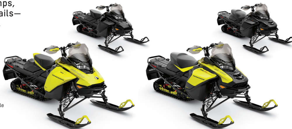
RENEGADE® ADRENALINE® 850 E-TEC® SHOWN

Tight cornering, big-bumps, high speed and rough trails—this sled conquers it all.