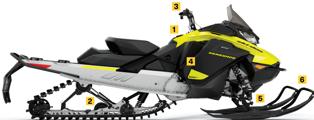
RENEGADE® SPORT 600 EFI SHOWN

Saves time and energy, adding immense value for the rider.