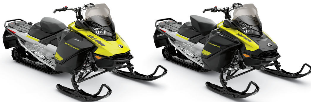
RENEGADE® SPORT 600 EFI SHOWN

Value-oriented with exceptional handling, bump capability and light off-trail riding.