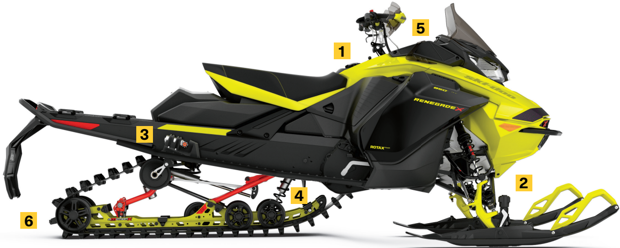
RENEGADE® X-RS® 850 E-TEC® SHOWN

Totally transforms the handling characteristics of the sled according to riding style or conditions with unmatched ease. Includes rMotion X Quick Adjust System and Pilot TX skis.