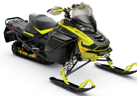
RENEGADE® X® 850 E-TEC® SHOWN