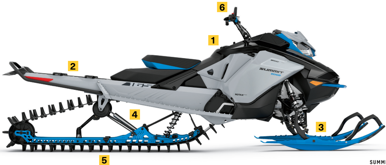
SUMMIT® EDGE® 165 850 E-TEC® SHOWN

Lightweight alloy spindle with revised geometry and new ski stopper to reduce ski drag for more predictable handling and a confidence-inspiring ride in technical sidehills and rough terrain.