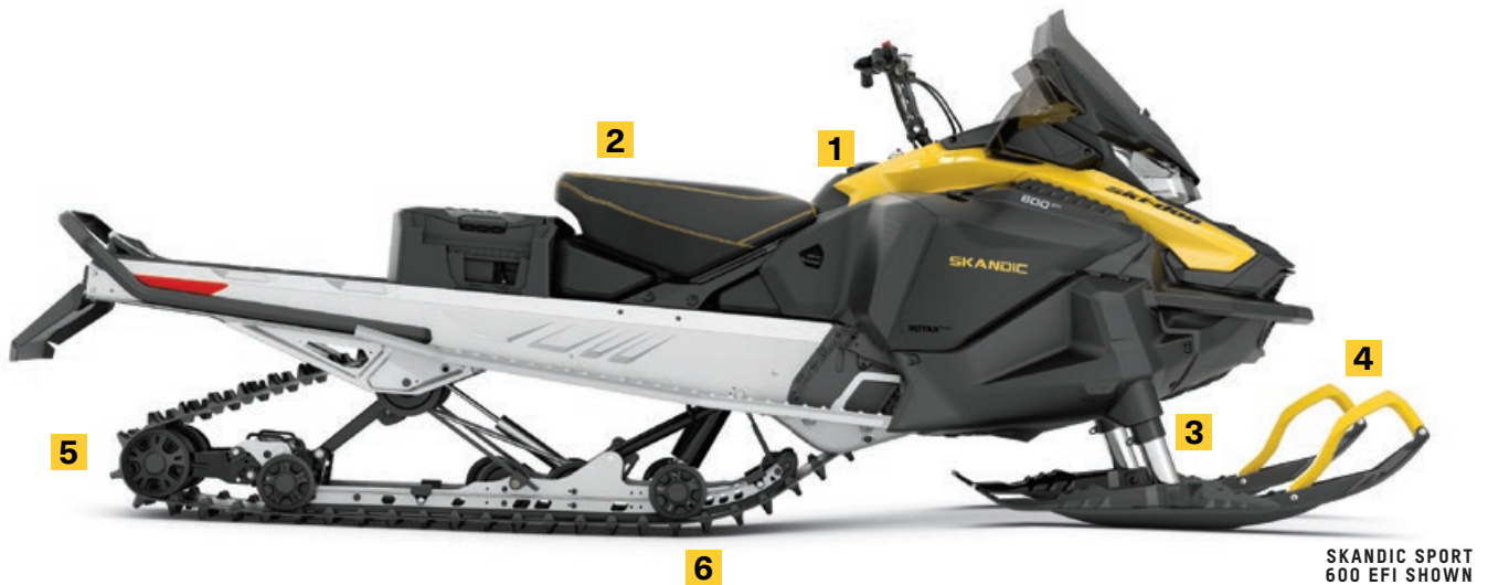
SKANDIC SPORT 600 EFI SHOWN

Industry-exclusive telescopic front suspension enables a large, flat belly pan for exceptional deep-snow flotation.