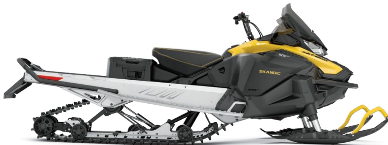
SKANDIC SPORT 600 EFI SHOWN

The best 20 in. utility value in snowmobiling.