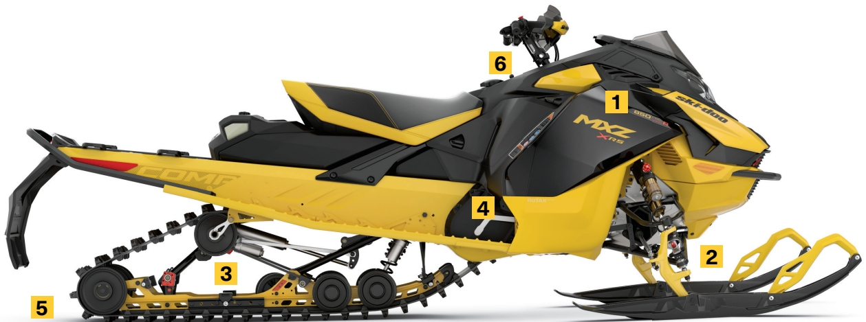
MXZ X-RS 850 E-TEC TURBO R WITH COMPETITION PACKAGE SHOWN

Competition-ready with reinforced rails and rear suspension plus heavy-duty track tensioner, acceleration link rods and arm extension.