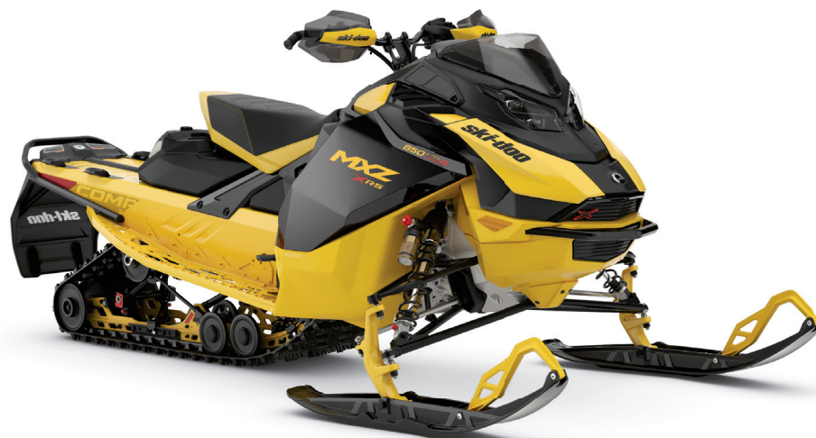
MXZ X-RS 850 E-TEC TURBO R WITH COMPETITION PACKAGE SHOWN