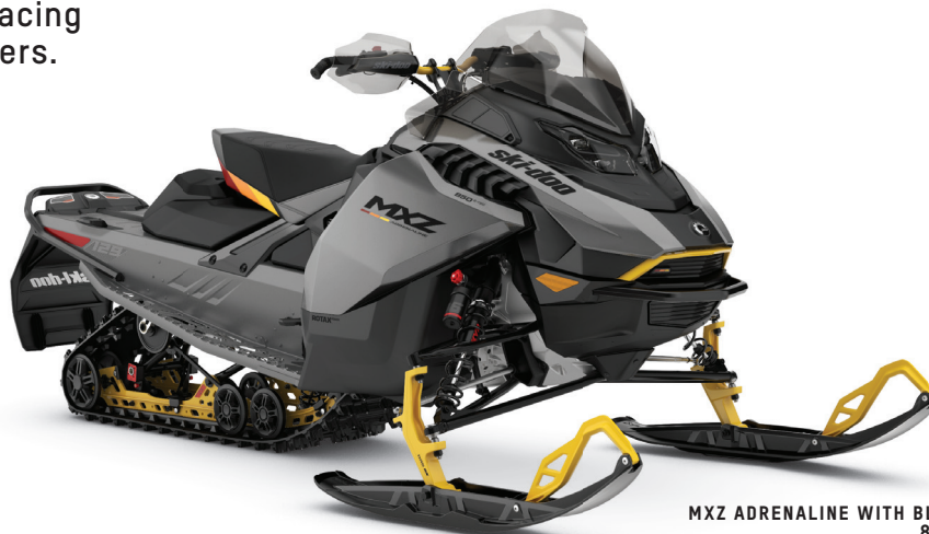
MXZ ADRENALINE WITH BLIZZARD PACKAGE 850 E-TEC SHOWN

High-tech features and racing DNA for hardcore trail riders.