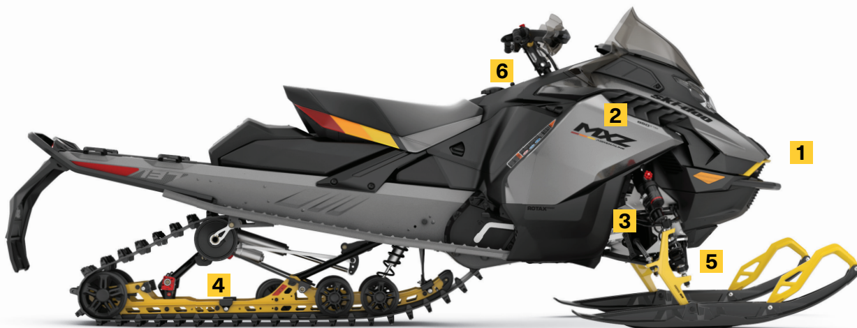
MXZ ADRENALINE WITH BLIZZARD PACKAGE 850 E-TEC SHOWN

KYB Pro 36 Easy-Adjust front and rear shocks featuring compression adjustment. HPG Plus center shock. All four shocks are aluminum and rebuildable/revalvable.