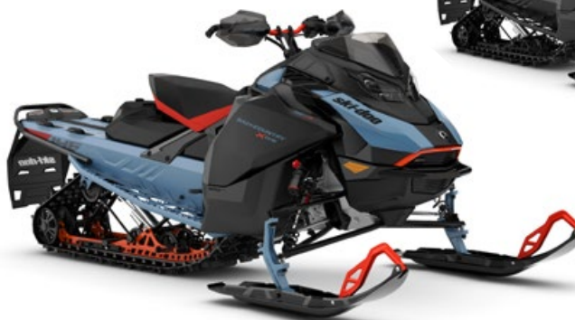
BACKCOUNTRY X-RS 146 850 E-TEC TURBO R SHOWN