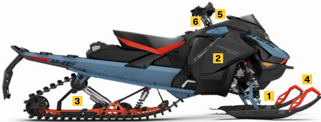
BACKCOUNTRY X-RS 146 850 E-TEC TURBO R SHOWN

Completely new lighter design is better balanced for performance on and off trail. Perfectly balanced weight transfer for an increased fun factor, more travel for more comfort and rail reinforcement for added strength.