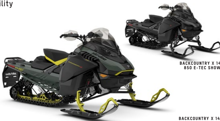
BACKCOUNTRY X 146 850 E-TEC SHOWN