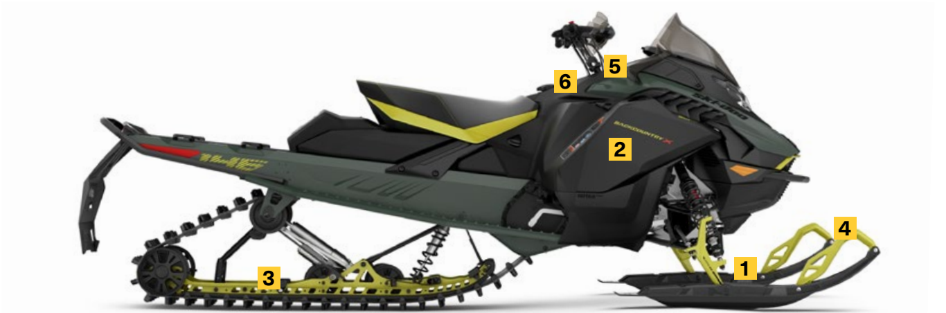
BACKCOUNTRY X 146 850 E-TEC SHOWN

Completely new lighter design is better balanced for performance on- and off-trail. Perfectly balanced weight transfer for an increased fun factor and more travel for more comfort and bump absorption.