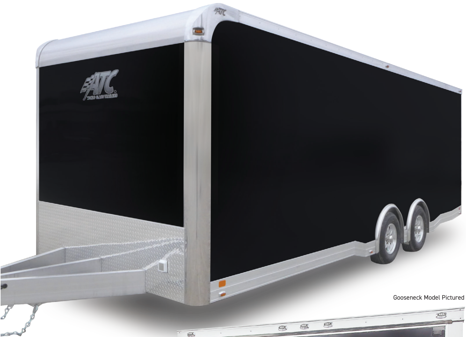
Gooseneck Model Pictured