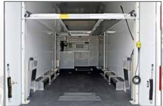
Trailers shown may feature optional equipment available at an additional charge.