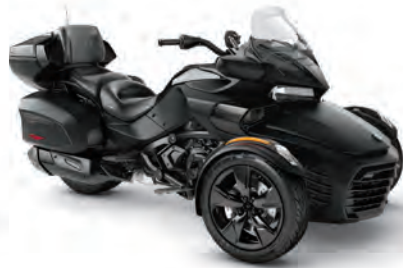
MONOLITH BLACK SATIN DARK*