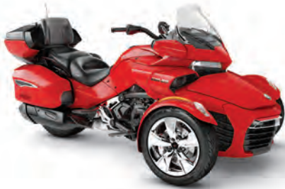
VIPER RED CHROME*