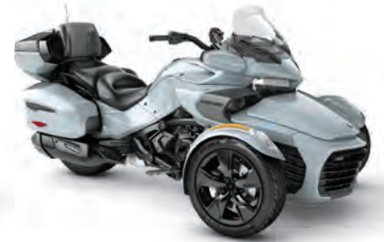
GLACIAL BLUE METALLIC DARK*