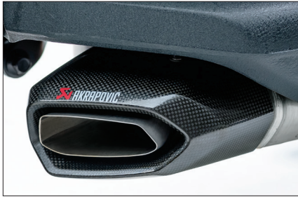
AKRAPOVIČ EXHAUST Unique sound signature and high-end exhaust.