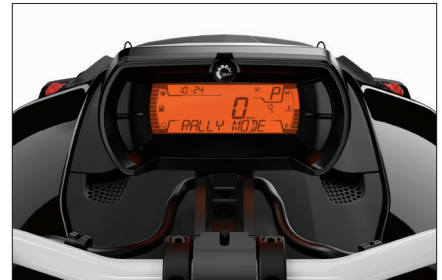
RALLY MODE AND TIRES Allows you to have more flexibility and fun off-pavement by optimizing VSS input and enabling you to perform controlled drifts with adapted all-road tires.