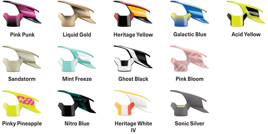
Pink Punk Liquid Gold Heritage Yellow Galactic Blue Acid Yellow Sandstorm Mint Freeze Ghost Black Pink Bloom Pinky Pineapple Nitro Blue Heritage White IV Sonic Silver