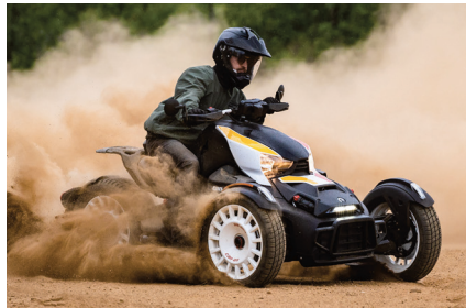
UNIQUE RALLY EXPERIENCE A vehicle designed for all-road trips with hand guards, Rally comfort seat for a more reactive rider position and adjustable large anti-slip foot pegs.