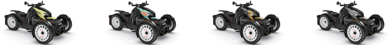
Lemon Twist Icepop Blue Gold Rush Silver Lava