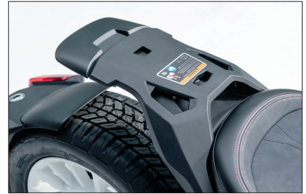
MAX MOUNT STRUCTURE Makes the unit 1+1 ready. It also increases the carrying capacity for different storage options.