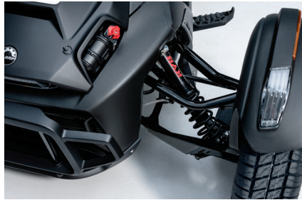
FULL KYB HPG SHOCKS Front and rear KYB HPG shocks with remote adjusters and 1 inch of extra suspension travel to optimize your ride and improve comfort.