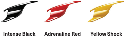
Intense Black Adrenaline Red Yellow Shock