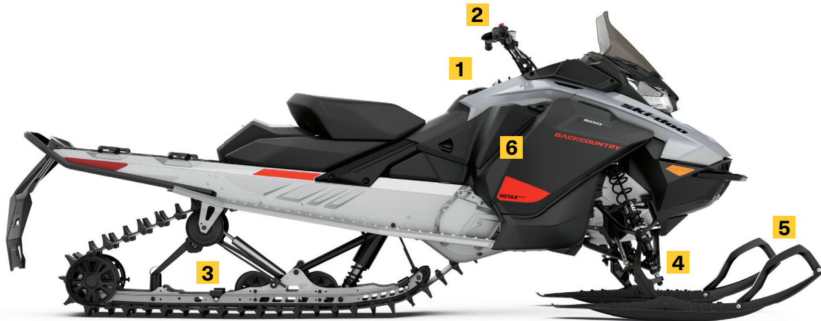
BACKCOUNTRY™ SPORT 146 600 EFI SHOWN

Saves time and energy, adding immense value for the rider.