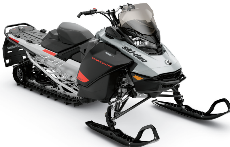
BACKCOUNTRY™ SPORT 146 600 EFI SHOWN

For the value-oriented 50-50 rider wanting an advanced platform and modern engine technology.