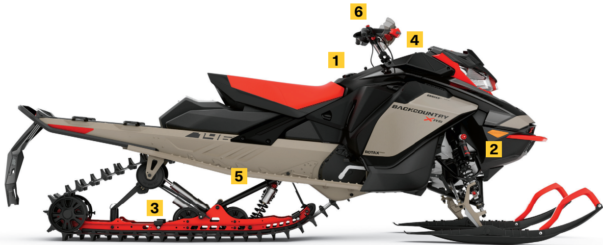
BACKCOUNTRY™ X-RS® 146 850 E-TEC® SHOWN

Crossover-specific suspension uses best principles of the rMotion™ trail and tMotion™ mountain skids for confident cornering and agile boondocking.