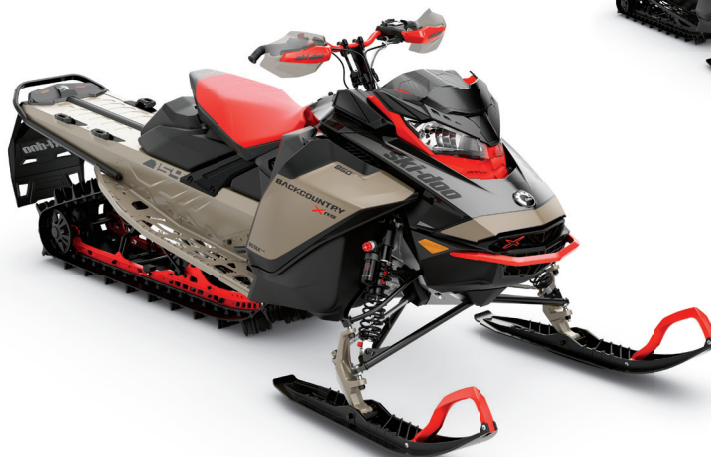
BACKCOUNTRY™ X-RS® 154 850 E-TEC® SHOWN

The most aggressive crossover vehicle with snocross attitude and go-anywhere capability.