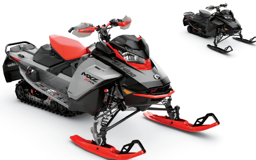
MXZ® X-RS® 850 E-TEC® SHOWN

A non-compromising race-inspired sled capable of taking on the roughest trails with ease.