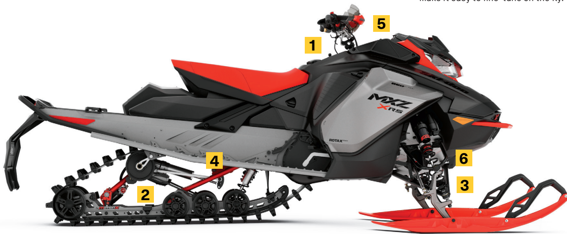
MXZ® X-RS® 850 E-TEC® SHOWN

Industry-first, innovative semi-active KYB shock technology provides the ultimate suspension performance available in snowmobiles. The system constantly reads engine parameters and chassis inputs, including steering, to adjust damping of shocks as needed to deliver anti-bottoming, lateral stability and forward and aft pitch control. Comfort, Sport and Sport + modes make it easy to fine-tune on the fly.