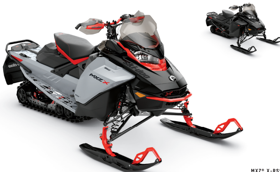
MXZ® X-RS® 850 E-TEC® SHOWN

High-tech features and racing DNA for hard-core trail riders.