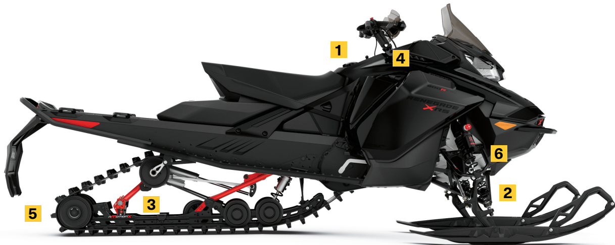
RENEGADE® X-RS® WITH COMPETITION PACKAGE SHOWN

Competition-ready with reinforced rails and rear suspension plus heavy-duty track tensioner, acceleration link rods and arm extension.