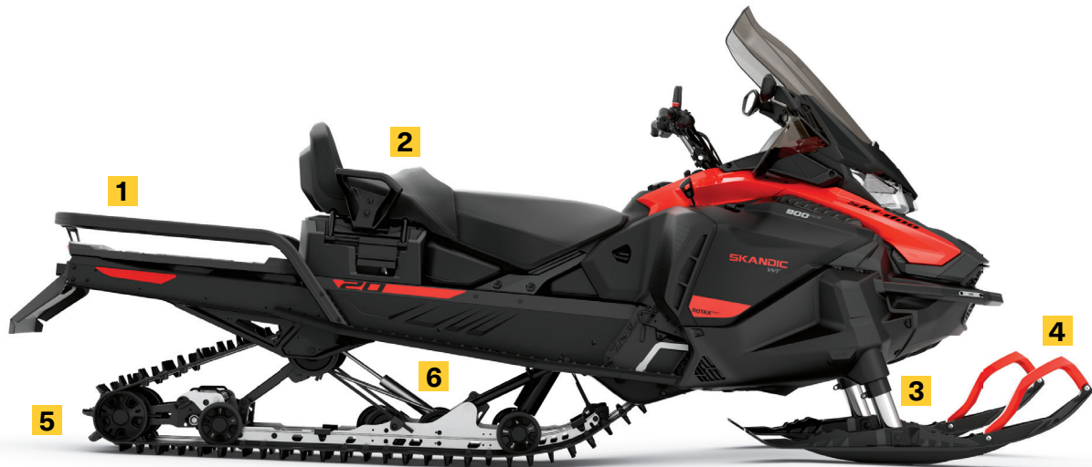
SKANDIC® SWT 900 ACE™ SHOWN

Industry-exclusive telescopic front suspension enables a large, flat belly pan for exceptional deep-snow flotation.