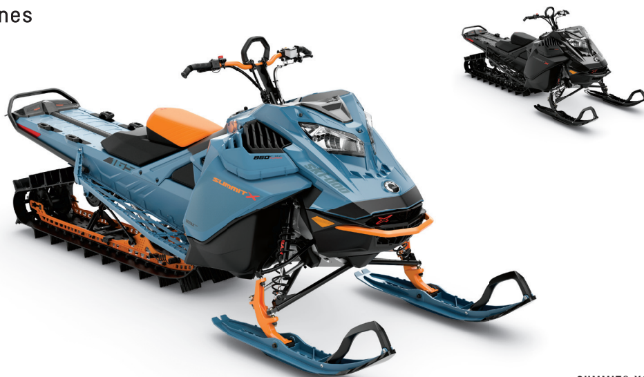
SUMMIT® X® 165 850 E-TEC® TURBO SHOWN

Longer climbs, tighter tree lines and deeper powder.