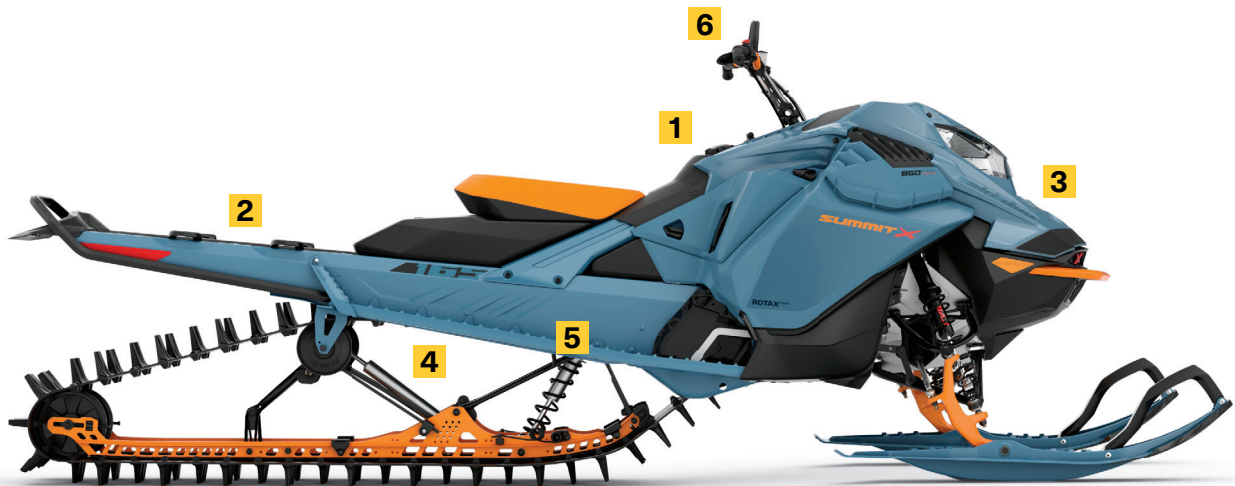
SUMMIT® X® 165 850 E-TEC® TURBO SHOWN

One-piece polypropylene construction instantly drops 6.2 lb of weight. Optimized ventilation for heat dispersion and noise reduction.