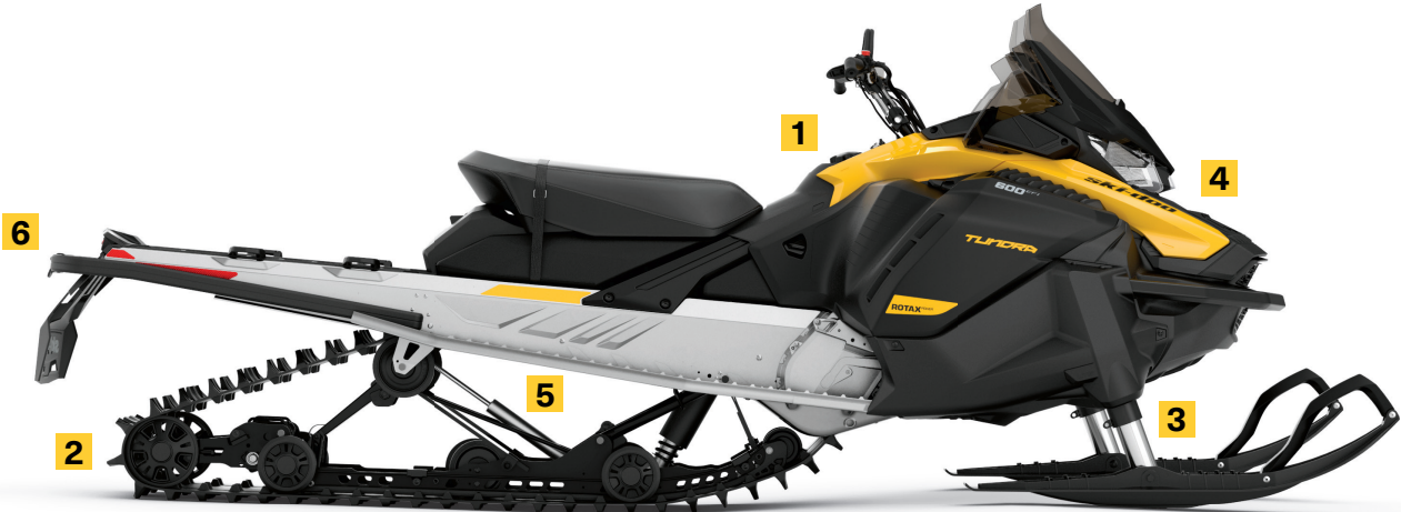
TUNDRA™ LT 600 EFI SHOWN

Industry-exclusive telescopic front suspension enables a large, flat belly pan for exceptional deep-snow flotation.