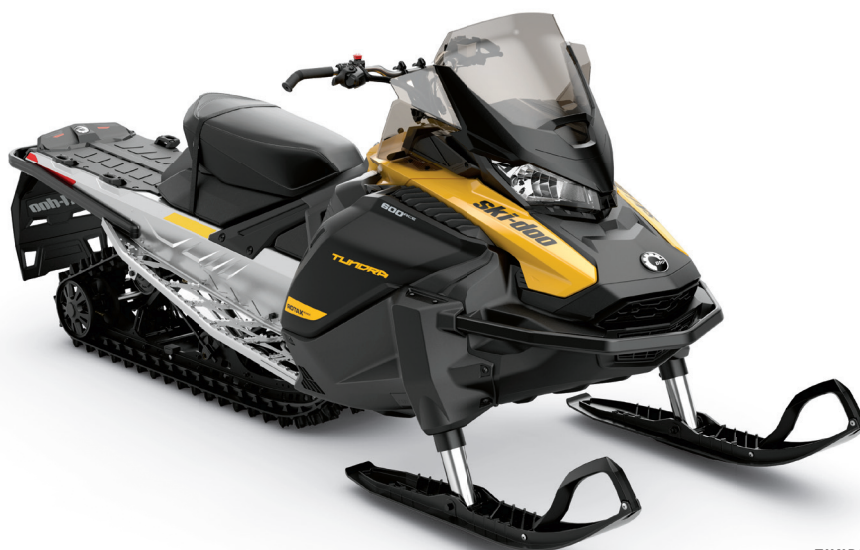
TUNDRA™ SPORT 600 ACE™ SHOWN

Economical, nimble and fun light-utility vehicle.