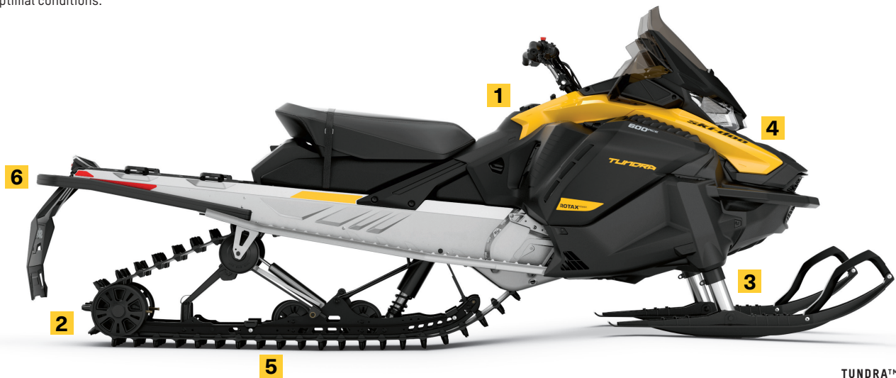
TUNDRA™ SPORT 600 ACE™ SHOWN

Industry-exclusive telescopic front suspension enables a large, flat belly pan for exceptional deep-snow flotation.