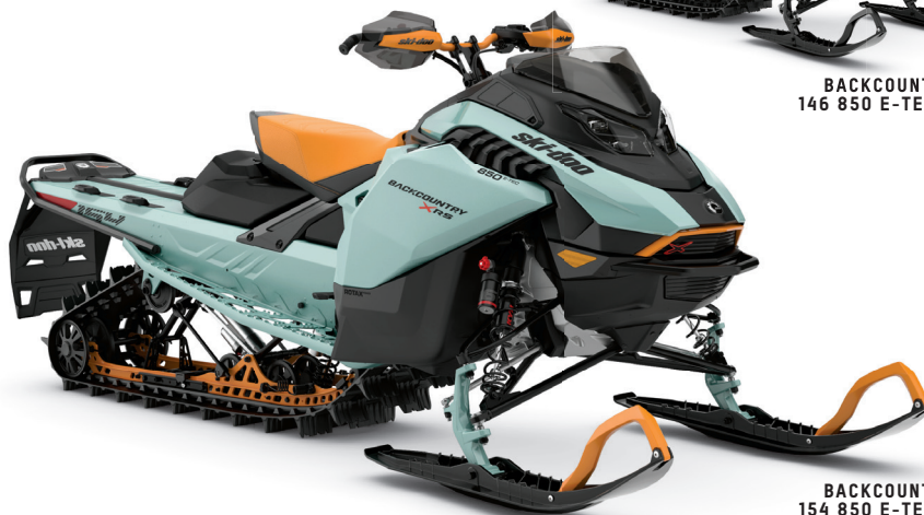
BACKCOUNTRY X-RS 154 850 E-TEC SHOWN