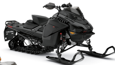
BACKCOUNTRY X-RS 146 850 E-TEC SHOWN

The most aggressive crossover vehicle with snocross attitude and go-anywhere capability.