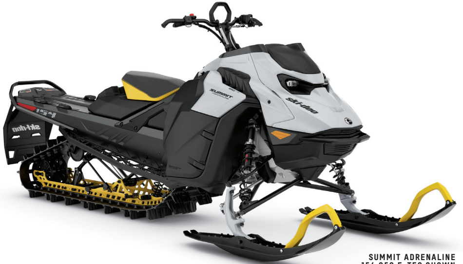
SUMMIT ADRENALINE 154 850 E-TEC SHOWN