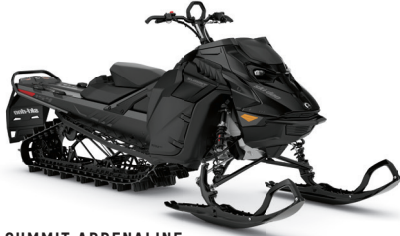
SUMMIT ADRENALINE 154 850 E-TEC SHOWN

An excellent deep-snow machine for any rider.