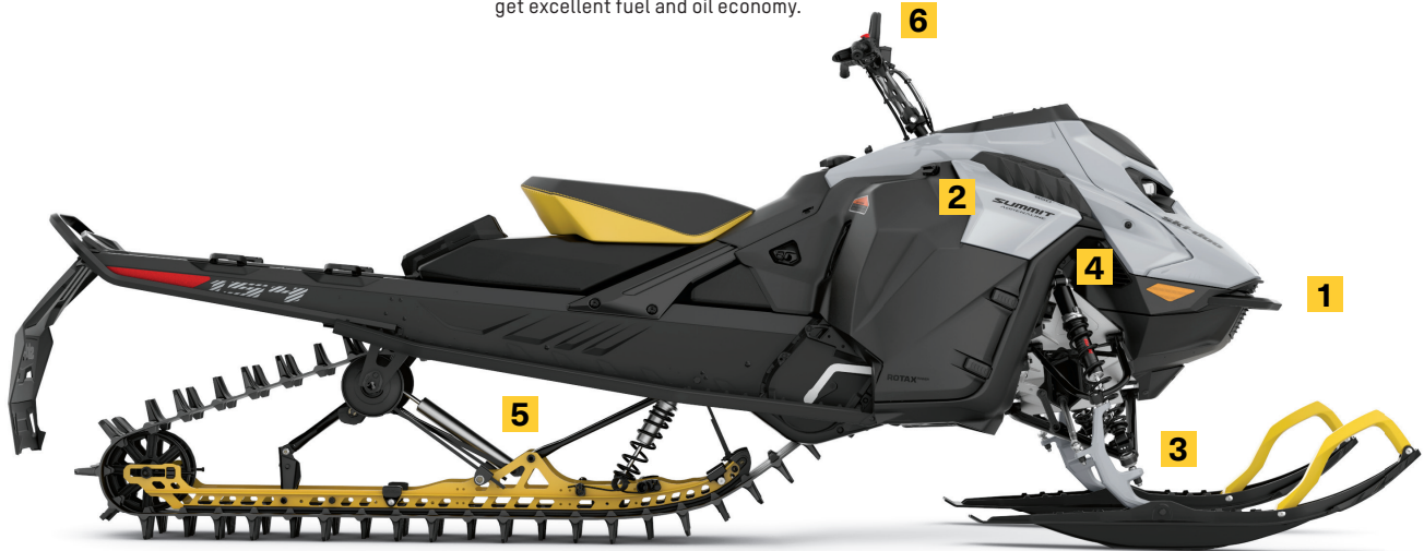
SUMMIT ADRENALINE 154 850 E-TEC SHOWN

Lightweight alloy spindle with revised geometry and new ski stopper to reduce ski drag for more predictable handling and a confidence-inspiring ride in technical sidehills and rough terrain.