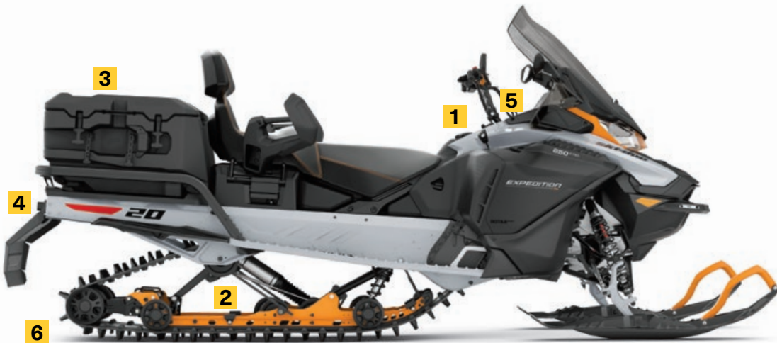
EXPEDITION SE 850 E-TEC SHOWN

135 L/35.7 US gal of lockable, weather-resistant storage capacity. Incorporated hatchet and saw holder, plus attachment points for bungees and two 16 in. LinQ positions on top for expandable accessory use.