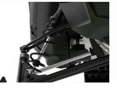
4 High-performance KYB Pro shock package with lightweight springs

Lightweight, extreme-capability, extremedurability shocks for control in the toughest conditions. Easy adjust-equipped for dialed-in compression.