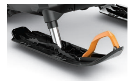
4 Ski liners Added flotation for extreme capability when your day takes you into the deep stuff.