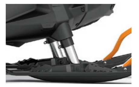
3 LTS front suspension

Industry-exclusive telescopic front suspension enables a large, flat belly pan for exceptional deep-snow flotation.