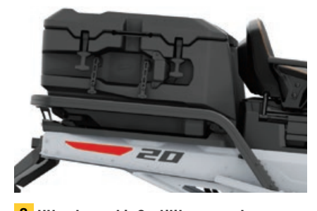
2 Ultra large LinQ utility cargo box 135 L/35.7 US gal of lockable, weather resistant storage capacity. Incorporated hatchet and saw holder, plus attachment points for bungees and two 16 in. LinQ positions on top for expandable accessory use.

Standard LinQ adaptable storage. Fits 16- and 20-inch-wide LinQ accessories to maximize accessory options. Up to 125 lb [56.7 kg] of cargo capacity.