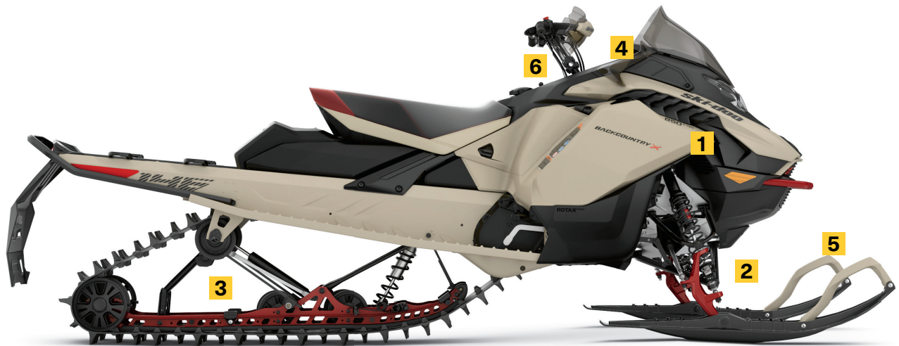
BACKCOUNTRY X 146 850 E-TEC SHOWN

Completely new lighter design is better balanced for performance on- and off-trail. Perfectly balanced weight transfer for an increased fun factor and more travel for more comfort and bump absorption.