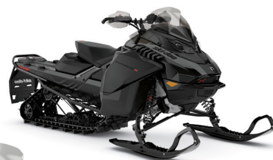
BACKCOUNTRY X 146 850 E-TEC SHOWN

A 50-50 sled with the most advanced technology, plus off-trail capability and rough-trail performance.