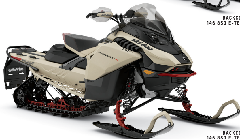
BACKCOUNTRY X 146 850 E-TEC SHOWN