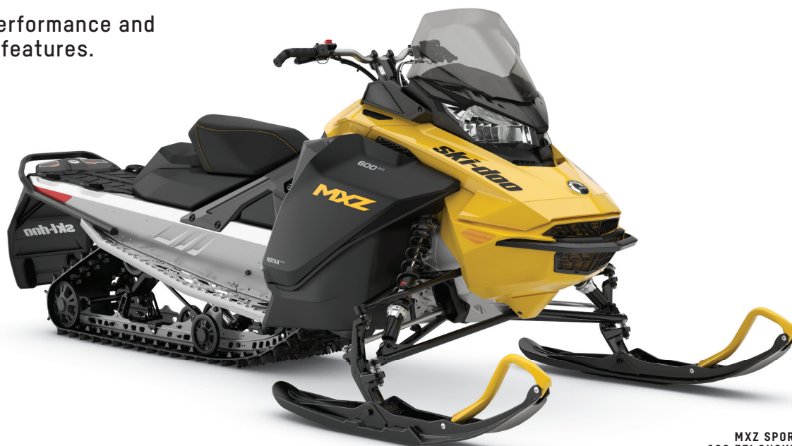
MXZ SPORT 600 EFI SHOWN

Dynamic trail performance and value-oriented features.