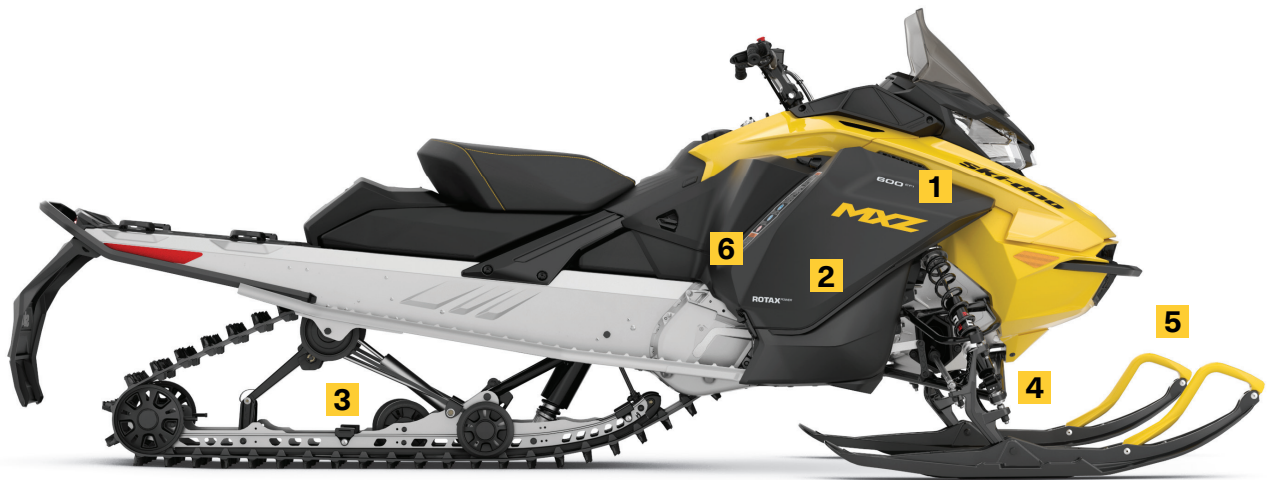
MXZ SPORT 600 EFI SHOWN

Offers great balance of comfort and performance.