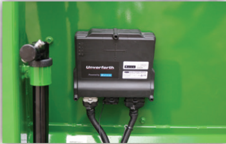
GCM-GRAIN CART MODULE