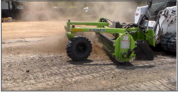
Great for land use soil preparation

All of the features of the SMR-800 but in a compact package. The rototilling action of the SMR-600's 6' drum breaks lumps, roots and other debris while reclaiming rocks by forming them in uniform rows. Great for land levelling, surface prep, soil conditioning, seed bed creation, driveway and walking path reclamation.