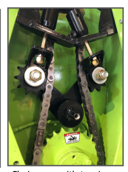
Chain case with tensioner and heavy #80 chain with easy access opening plate.