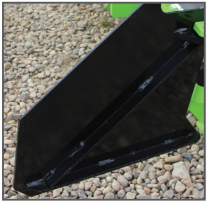
Adjustable, reversable side plates can be mounted on front or back of the unit