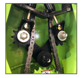
Chain case with tensioner and heavy #80 chain which is run in an oil bath and accessable with an easy access cover plate.