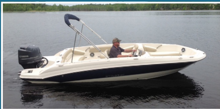
Note: Boat shown with optional outboard power.