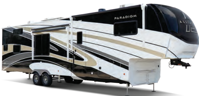
Full Body Paint Option Gold