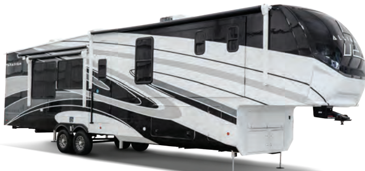
Full Body Paint Option Black