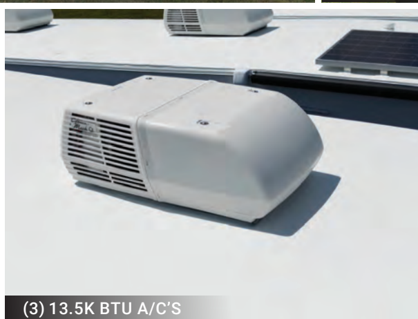
(3) 13.5K BTU A/C'S