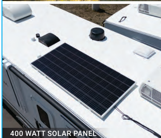
400 WATT SOLAR PANEL