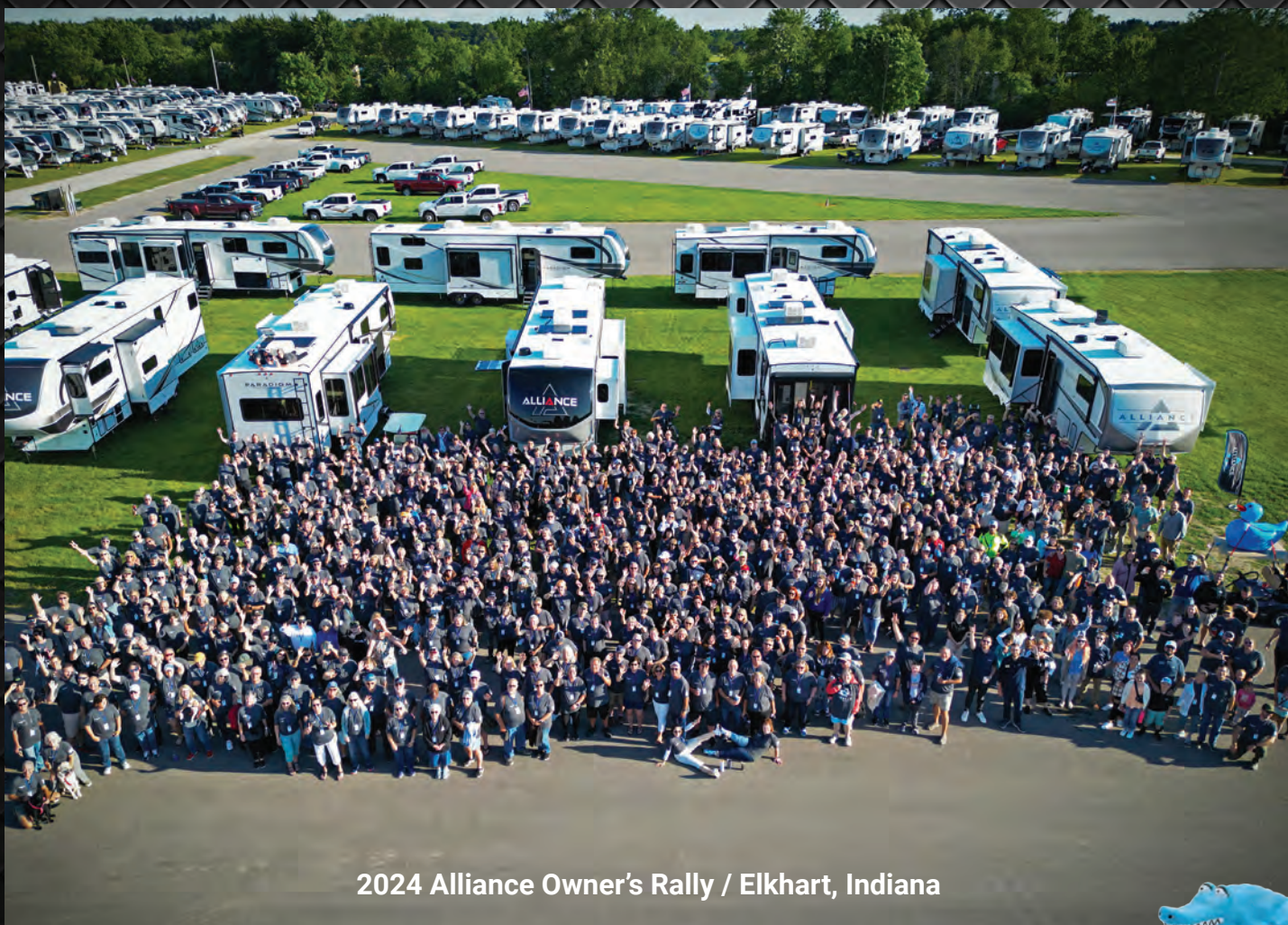
2024 Alliance Owner's Rally / Elkhart, Indiana