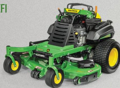
60 in. 71RON™ PRO SIDE DISCHARGE MOWER DECK