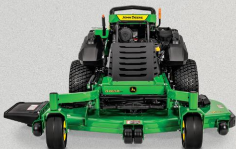
72 in. 7IRON™ PRO SIDE DISCHARGE MOWER DECK