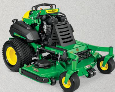
60 in. FASTBACK™ PRO REAR DISCHARGE MOWER DECK

The 865R EFI QuikTrak™ brings a fuel-injected 34.5 horsepower V-twin engine that is the most powerful stand-on mower in the John Deere stand-on mower lineup. With 12 mph (19.3 km/hr) mowing speed, 72-inch 7Iron™ PRO, 60-inch FastBack™ PRO, and 60-inch 7Iron™ PRO mowing decks, there's no doubt about it. For hillside mowing and challenging terrain, this is the one.